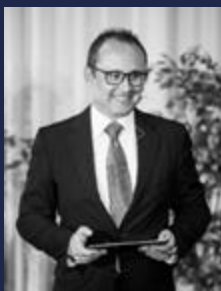
MEP Cristian S. Bușoi