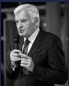
MEP Jerzy Buzek