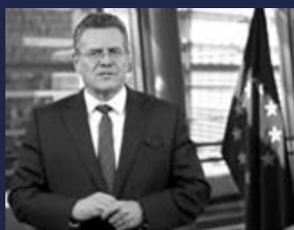
Maroš Šefčovič EC Executive Vice- President