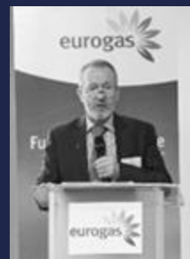
MEP Sean Kelly