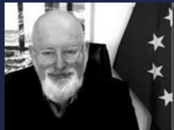
Frans Timmermans, Former EC Executive VP